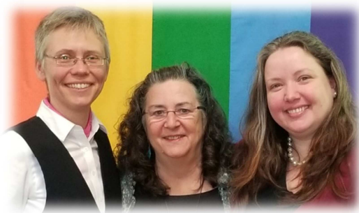
Our programme staff

Join us at our Sunday service on March 25 , when we'll gather our pledges and celebrate our commitments. Please plan to come, and bring your pledge! If you can't attend, please make sure you return your pledge form (or pledge online at unitarianscalgary.org ) by April 8 .