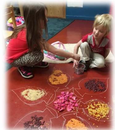
We provide our children and youth with opportunities for fun and growth.