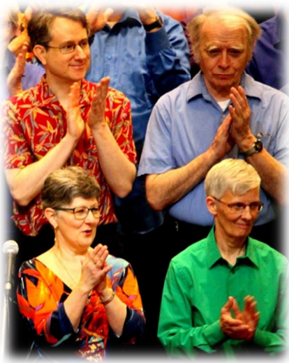
We produce concerts: classical, choral, jazz, Cabaret

We welcome, value and celebrate diversity. We provide a place for people of all ages to build relationships and care for one another. We strive to be radically inclusive.