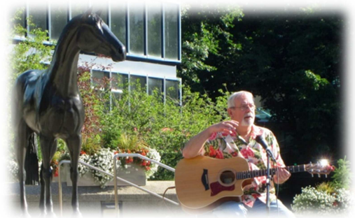
We take our beliefs in social justice out into the wider world