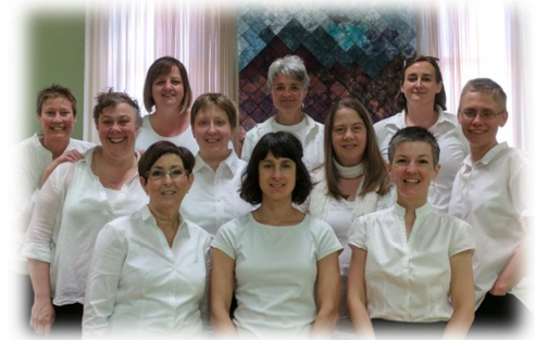
The BarberEllas presented a special Sunday service